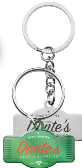
MK2004 Stainless steel with offset/epoxy.