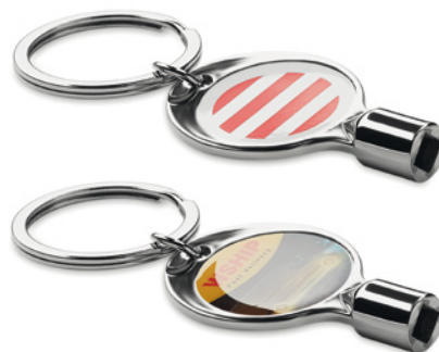
MK1008 Radiator key ring.