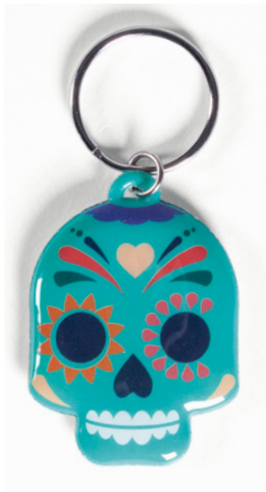
MK2015 PVC vinyl key chain in own shape.