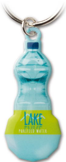
MK4009 Full colour, custom shape.