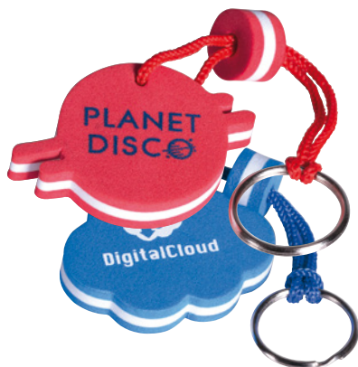
MK2017 Floating EVA key chain in own shape.