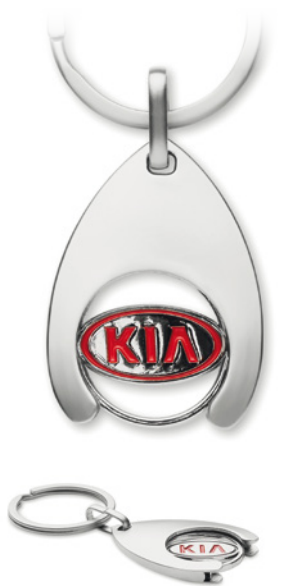
MK4010 Claw shape.