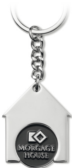
MK4001 House shape holder.