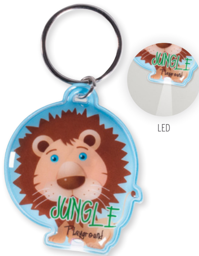
MK2016 PVC vinyl key chain with LED light in own shape.