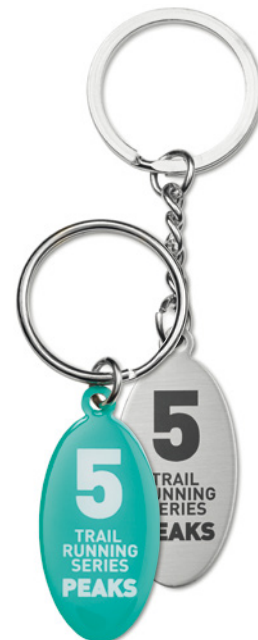
MK2003 Your keyring will surely make an impression utilising the versatility of soft rubber PVC.