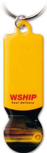
MK4009 Full colour, standard shape.