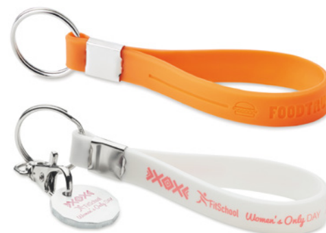
MK1004 Pantone matched silicone key ring with optional trolley token.