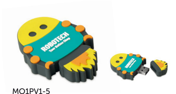
Tailor Made PVC USB in your own 2D or 3D shape.